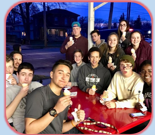
Charlotte Campus Life

Campus Life High School ministry combines healthy relationships with creative programs to help young people make good choices, establish a solid foundation for life, and positively impact their schools.